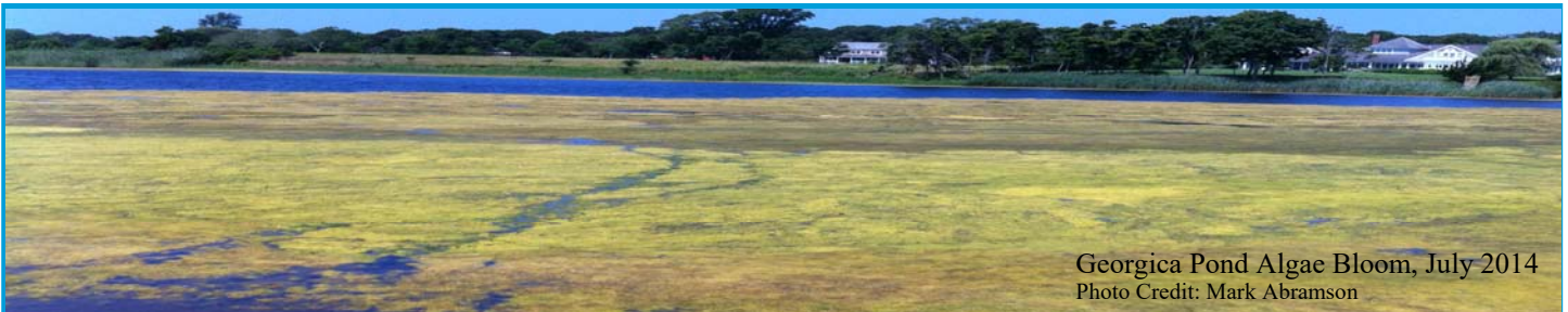
Georgica Pond Algae Bloom, July 2014