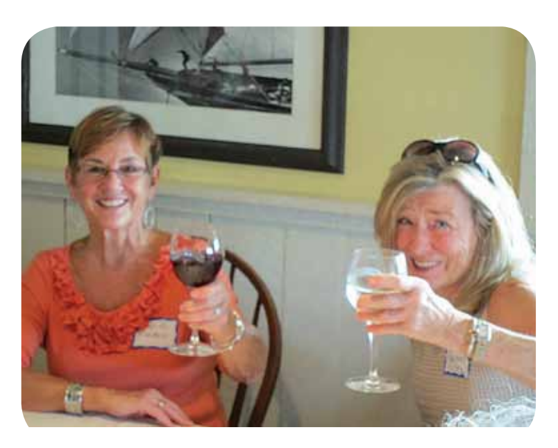
Cheers to a fun evening with friends who love Montauk.