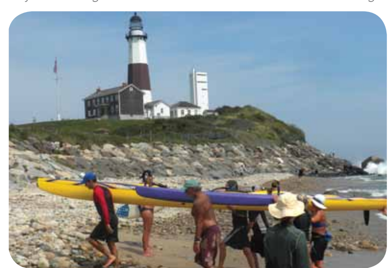
Coming ashore and heading to a celebration at Montauk Point State Park.