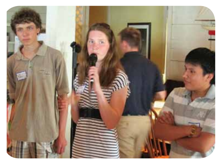
Three of our interns from East Hampton High School – future environmentalists!

One of our favorite nights of Summer 2012 was our inaugural Member Appreciation and Open Forum evening at Gosman's Dock on June 21. More than 120 CCOM members, friends, and those who wanted to learn more about us turned out for a hot summer evening for cocktails and conversation.