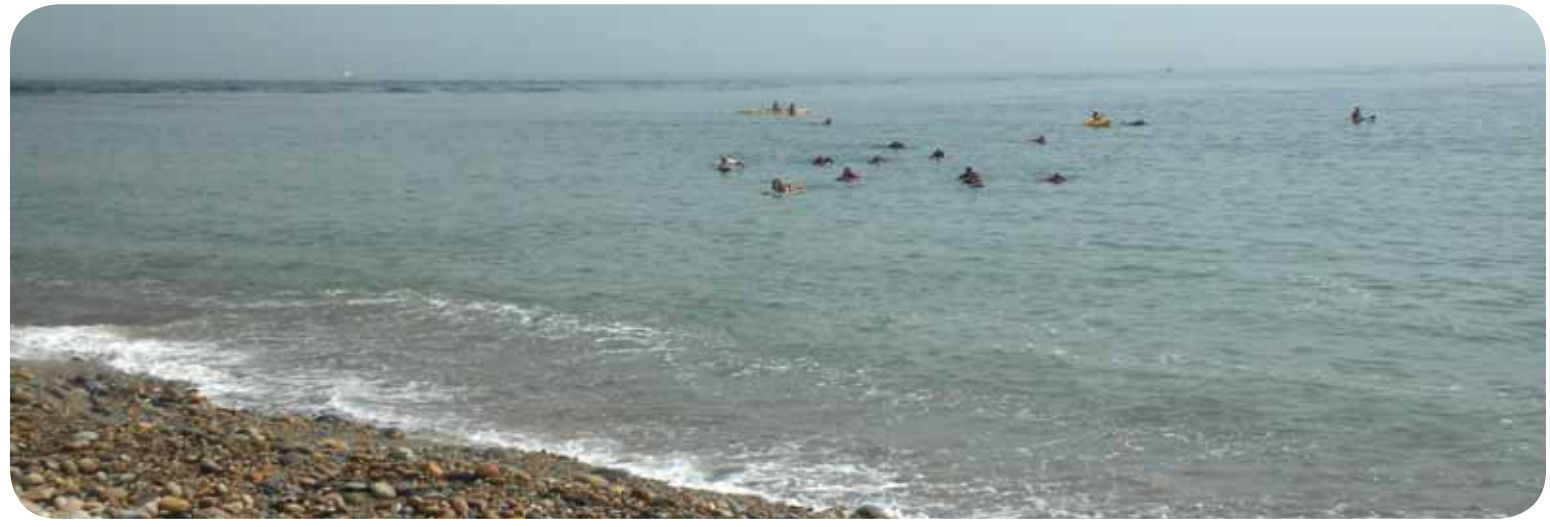
Kayakers ending their "Tour for the Shore" at Montauk Point on August 24.